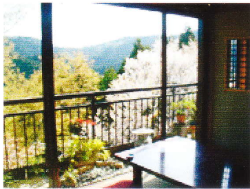
Cherry blossoms from inside the restaurant