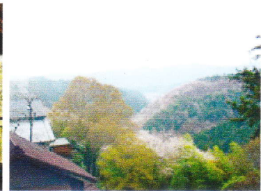
View from upstairs

Hours: 1000 - 1900 (extended for bookings) or November).